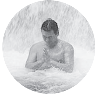
Misogi (Ritual Bathing)

NOTE: This is a prayer asking for the purification of sins as well as uncleanness and impurity called “ tsumi ” and “ kegare ” that pollute and defile a person’s spirituality. Mythology tells us that Izanagi-no-Okami cleansed and purified Himself in the water after He came back from the unclean underworld. Through His act of cleansing and purifying Himself, the designated Kami of cleansing and purification arose. This is the origin of misogi (ritual bathing) in Shinto.